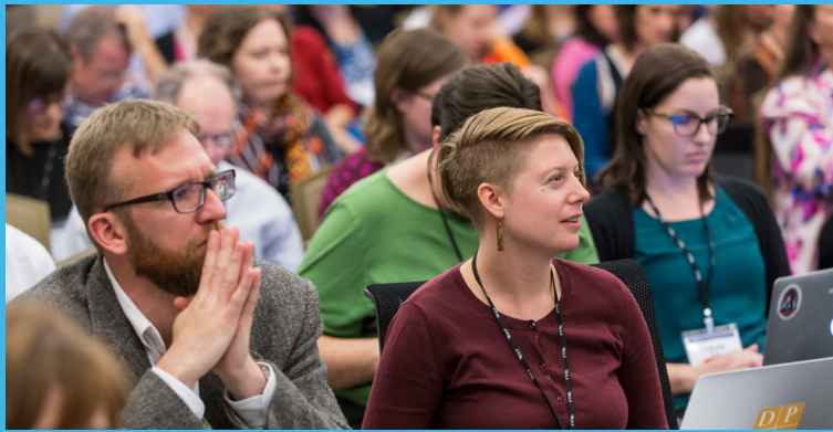
The 2014 DLF Forum held in Atlanta, GA